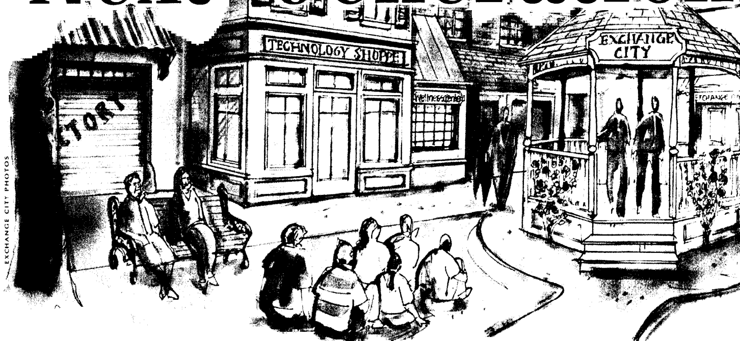
EXCHANGE CITY PHOTOS

Exchange City New England teaches kids the ABCs of Economics.